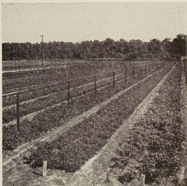
This is how our Azaleas look. Visit us and see our fine stock.

CORAL BELLS - Hose-in-hose deep pink. The favorite pink Azalea 6-8 in. to 10-12 in.